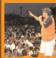
Central City 341 saved