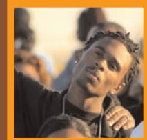
New Orleans 248 saved