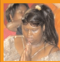
Meridian, MS 465 saved