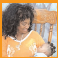
Harvey 244 saved