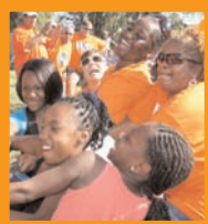
Westwego 195 saved