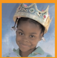
Algiers 214 saved