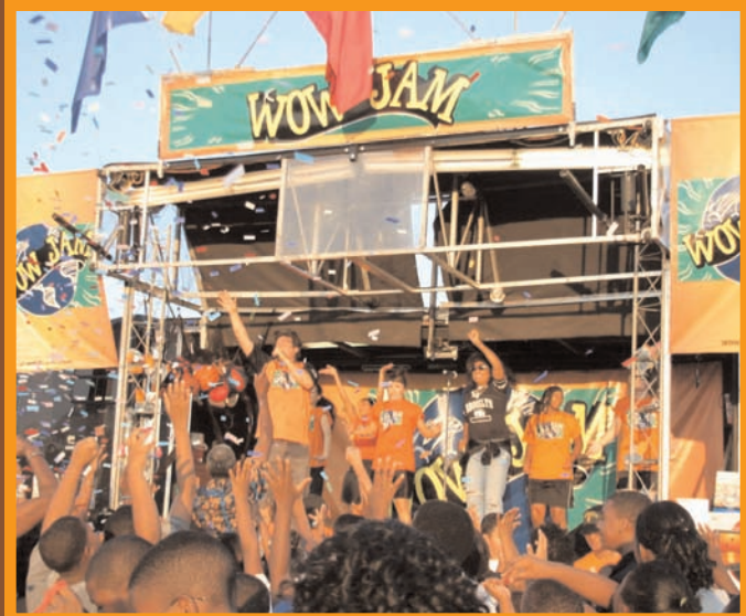
We ended the year with a bang with 7 WOW JAMS in New Orleans.