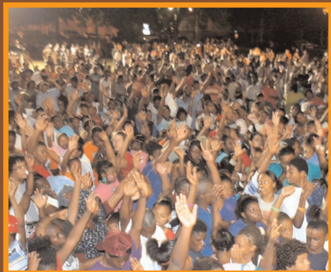
Over 1,900 people accepted Jesus at the WOW JAMS.