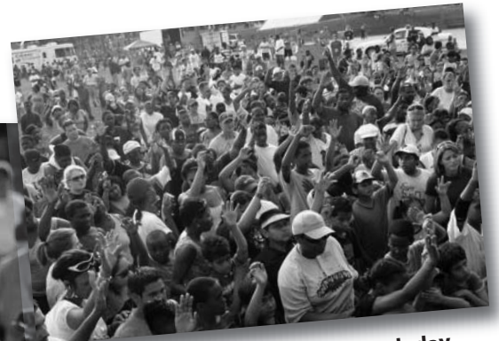
Hundreds received Jesus each day.