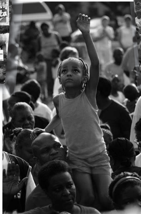
The children were reaching out to God with hope and belief in their hearts.