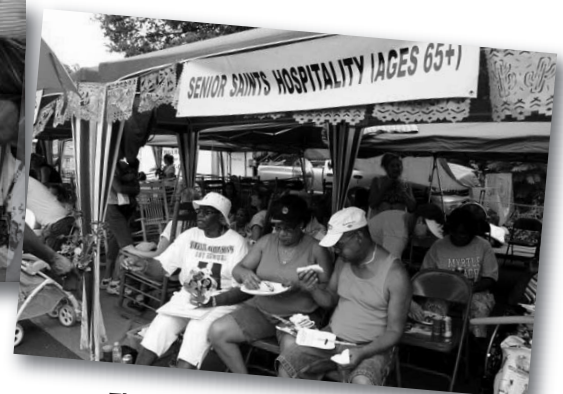
This tent came in handy for the older saints, especially when the temperature hit over 100°.