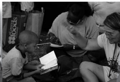
A little boy who just got saved reads his brand new Bible.