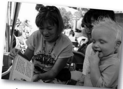
A new tent called the Book Nook was where little children were read to and then given the book.