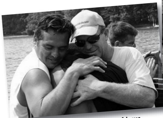
The healing power of the love of Jesus was all over the place.