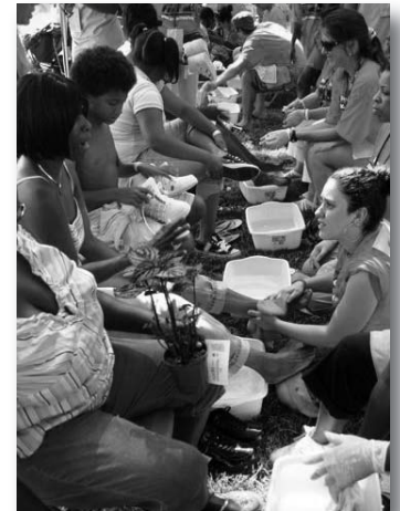
A great ministry, Samaritans Feet, came and washed 1,000 people’s feet, anointed them with oil, and then gave them new shoes. It was a very moving tent with 89 getting saved right there.

PS: We are going to begin sending the newsletter, and my brief email updates, to those who’d like to receive it online. Join that list by sending in your email address to info@wowjam.com . This is much more convenient; it saves money for the ministry; and it keeps you up to date on where your investment is going.