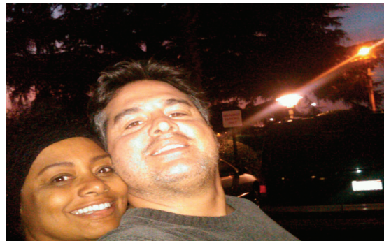
Leaving the hospital with a good report!!

P.S. Please note our NEW MAILING ADDRESS which is P.O. Box 6308, Altadena, CA 91003 . To donate, please make your check out to WOW Int'l or go to www.wowjam.com .